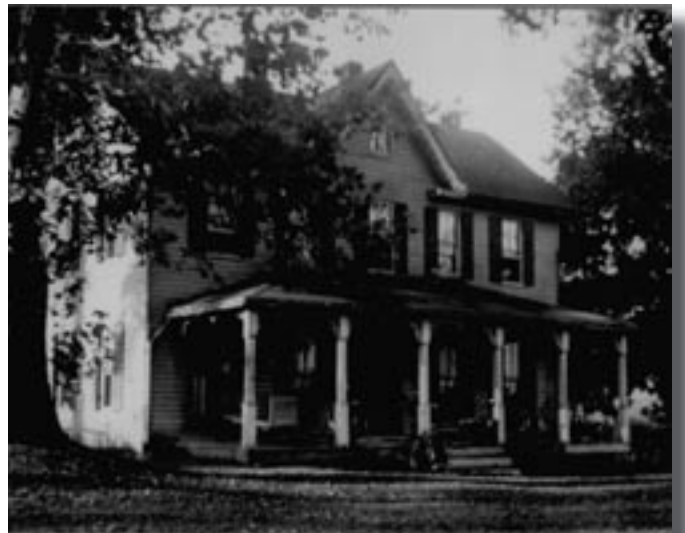
The 1889 addition shown in a c. 1920 photo.