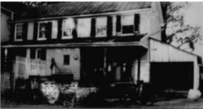
Original portion of the house as it appeared c. 1920.

Originally called Salopia after Salop County in England, the spelling was changed in deeds in the 1820s. A chance conversation in England led the Greenwalds to the explanation of the name change. Be sure to ask about it.