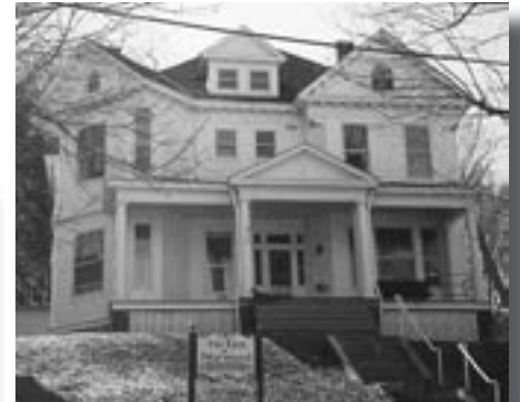
The Inn at Norwood.

House and the Gate House Museum. Proceeds will go towards projects of the Historic District Commission.