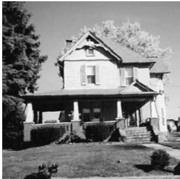
7319 Springfield Avenue.

Tickets are $15 and are available in advance and on the day of the tour at the Town