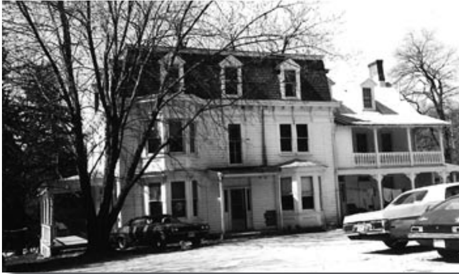
The Schultz house before it was demolished.

in Sykesville. The guests arrived on the evening train, Dec. 30 bearing bunches of holly & mistletoe and armed with tin horns, with which they made ‘the welkin ring’ (a celebratory loud noise). Even the ‘sticking’ powers of Sykesville