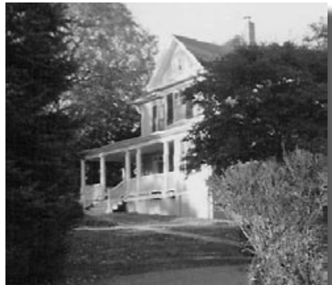
7307 Spout Hill Road.