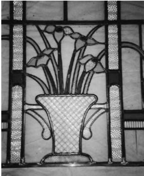
A small section of the B&O stained glass window.

Looking for stained glass windows, old doors and floors or claw foot tubs? Try Second Chance, the new salvage store in downtown Baltimore near