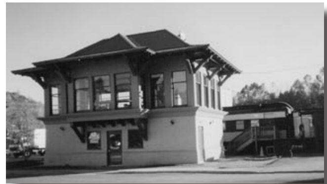
The new Visitor Center and Post Office.

Now the first floor has a post office, visitor center and public restrooms with a large meeting room on the second floor.