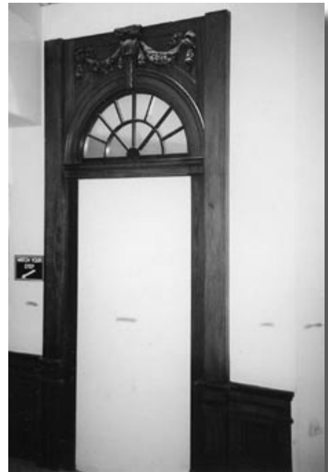
The board room door at the old B&O Building in Baltimore.

Find out where a man who owned most of Main Street at one time ended his days renting a house after some financial misfortunes. Or where school teachers used to board in the 1940s and 50s. Try to identify which house used to be a harness shop. Ask which house had a sunken garden. Or where the blacksmith