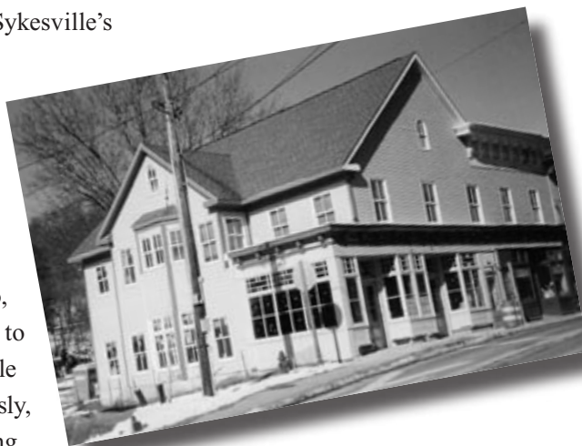
Future home of Samsara Salon and Spa.